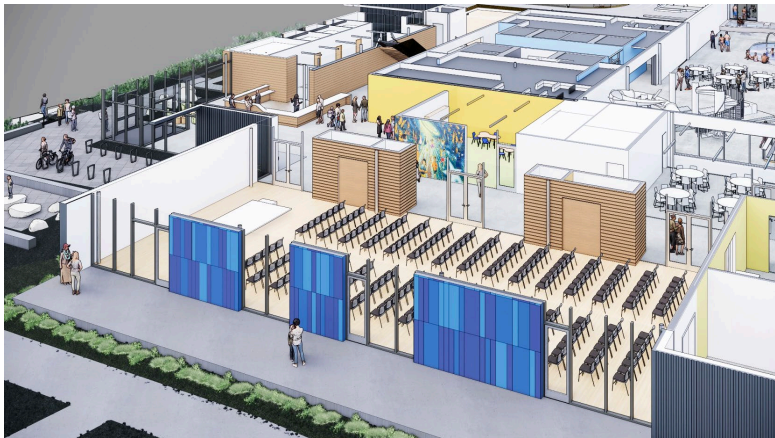
Lecture 210 Seats

A community multi-purpose room and event spaces (3,200+ sqft) with a commercial kitchen that can be used for special events, senior meal programs, job training opportunities, local nonprofits, and as an incubator space for small businesses.