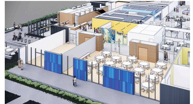
Subdivided 210 Seats