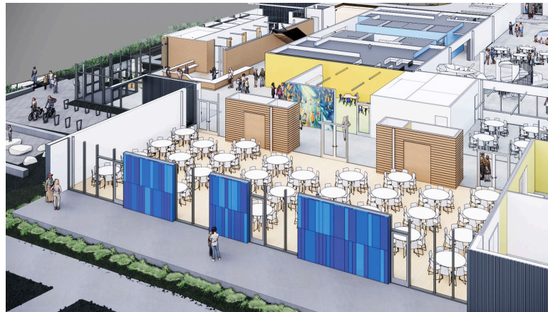
Gala 248 Seats